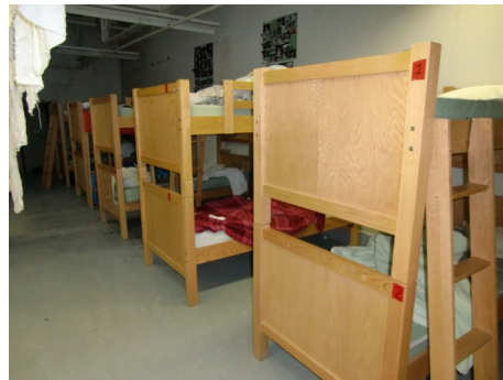
Inside the homeless shelter

“He who has pity on the poor lends to the Lord. And He will pay back what he has given.”