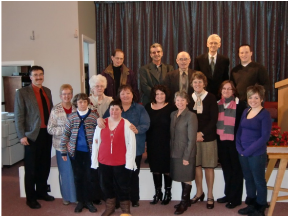
Native Ministries Group, Bridgewater Church, NS

It's been my privilege to provide cross-cultural training at conference campmeetings, and workers' meetings in places like BC, Alberta, Man/